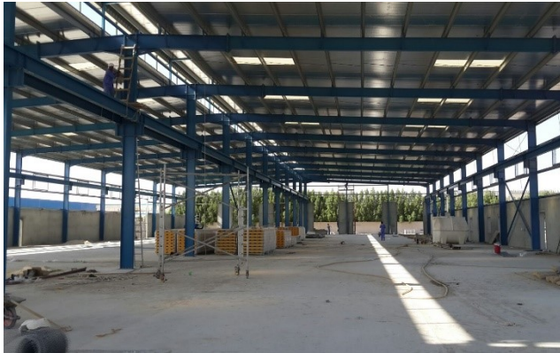
Office and Production Building in DIC for Biston Steel Manufacturing plant.