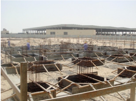
Chemical plant for Moheb at Jebel Ali Free Zone, Dubai