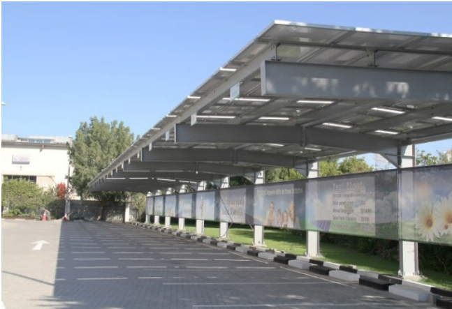
Emicool, Investment Park, Dubai