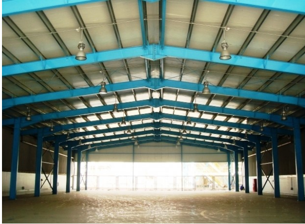
Sheds and Open Facilities for DEWA, at Jebel Ali Power Plant, G station