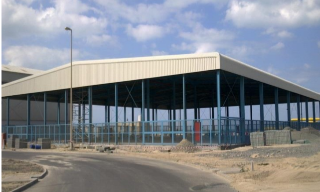
Chemical Warehouse for DEWA at Jebel Ali Power Plant, E Station