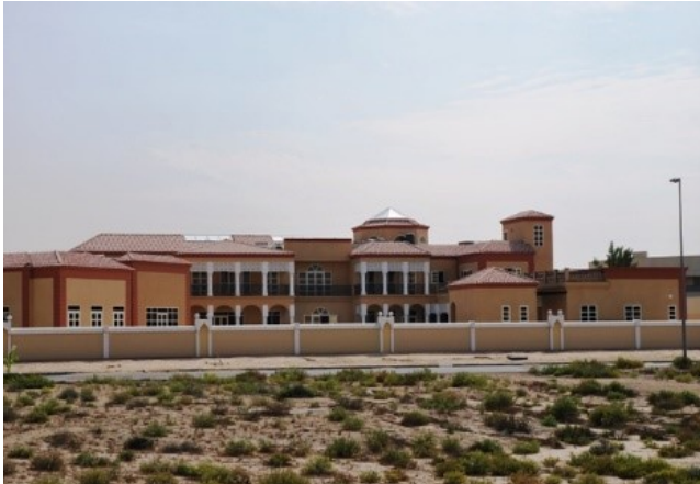
A Luxury Villa for Al Mulla Family at Neda Shiba